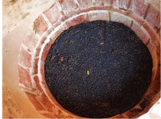
Wine making inside the 18th century Clos Montblanc farmhouse.