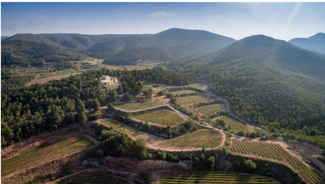
Today's photograph of the 17th century family farm, the beginning of the Clos Montblanc wine tradition.