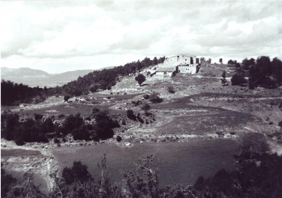
The 17th century family farmhouse, the beginning of the Clos Montblanc wine tradition.